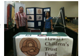
Hawaii Children's Trust Fund

TIFFE hosted an booth which allowed us to network with state and international agencies. We were able to meet and share program goals and outcomes with countries such as Turkey, Tazmania, Iran, Chile, and Samoa. TIFFE was able to bring back many innovative ideas and initiatives that can be applied at a grass roots level. Overall it was a heart warming and inspiring experience to see how many nations, occupations, and individuals are dedicated to nurturing and protecting our keiki on a global level.