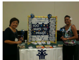
Prevent Child Abuse Hawaii