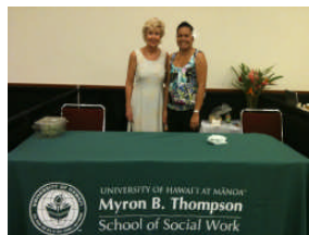
University of Hawaii